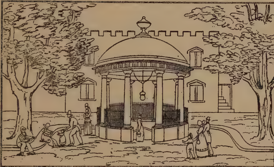
CITY SPRING—CALVERT STREET.